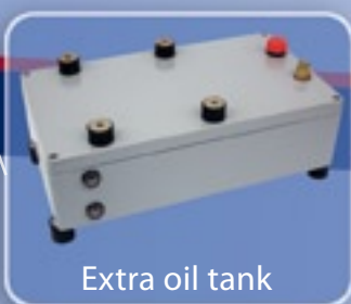
Extra oil tank

Record and print attained torque and other data.