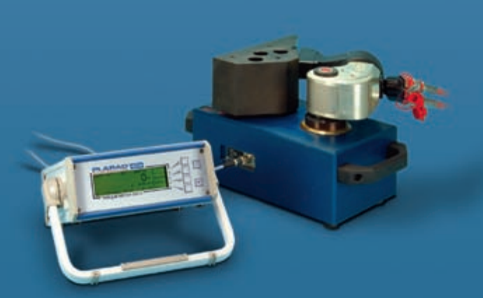
Test device PH for the testing of electric and pneumatic torque wrenches/hydraulic wrenches.

For the testing and presetting of bolting tools, the GMV 2 system and the corresponding testing device is the ideal combination.