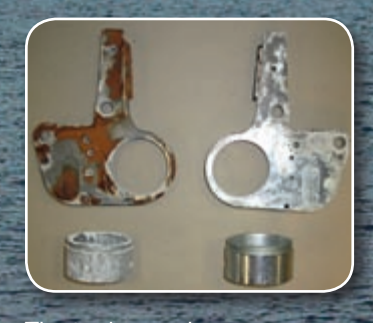
The tools are also salt spray tested.

The demands on material, tools and workers in the offshore world are extreme – the materials in our tools are designed correspondingly.