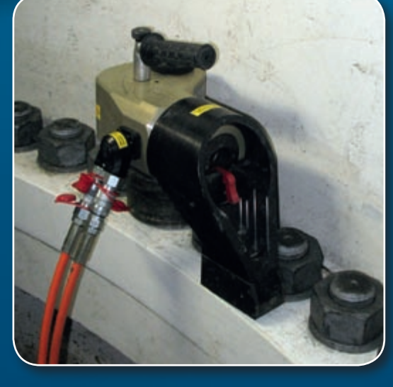
MX-EC 200, Bespoke design for M 64 bolts – specially developed for windpower

The reaction arm can be quickly and easily mounted anywhere around 360°